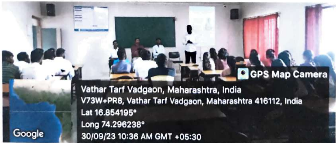
Vote of Thanks