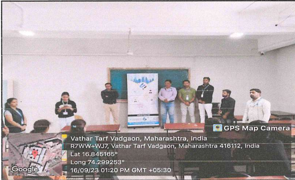
Introduction of Guest (Softmusk Company)