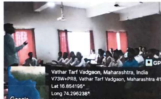
During the Session