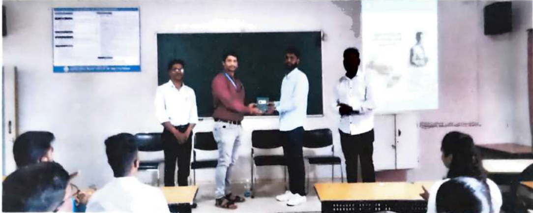
Welocme & Felicitation of Resource Person