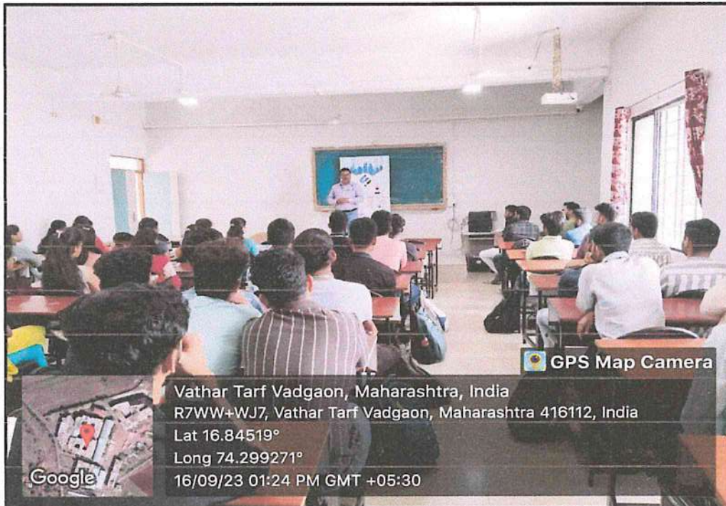
Interactive session with students